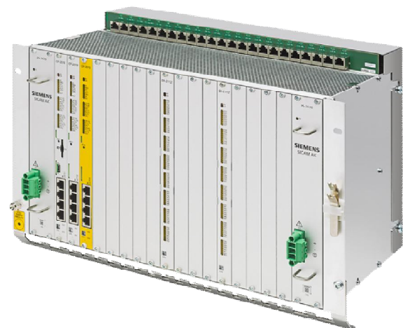
SICAM AK 3 (design: 17-slot rack)

Like all products of the SICAM RTUs system family, the SICAM AK 3 is integrated into the SICAM TOOLBOX II object-oriented engineering software.