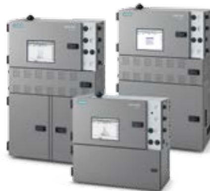
MAXUM Edition II process gas chromatograph